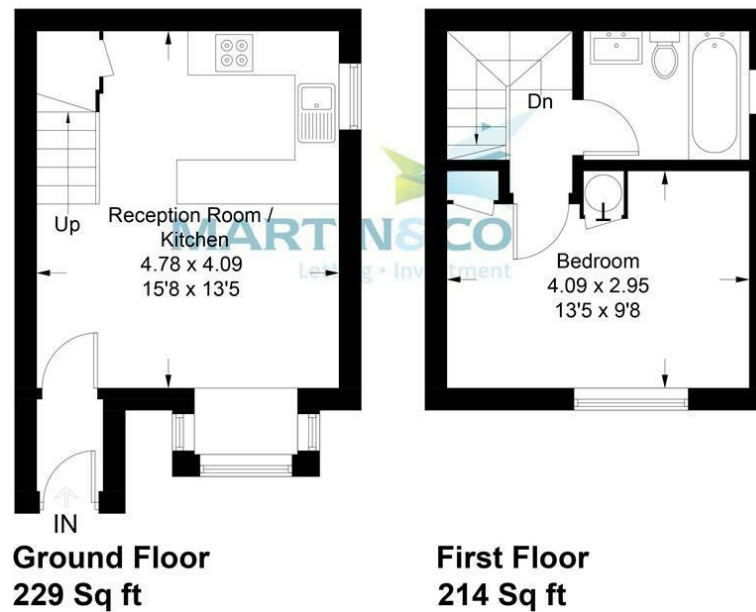
Illustration for identification purposes only, measurements are approximate, not to scale. FloorplansUsketch.com © 2018 (ID 467045)

Approximate Gross Internal Area Total = 41.1 sq m / 443 sq ft